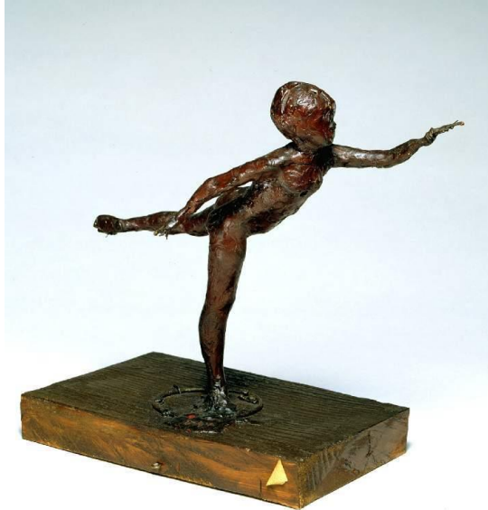
No: M.6 - 1990

(Move children to see the cabinet containing the sculptures of dancers by Degas)