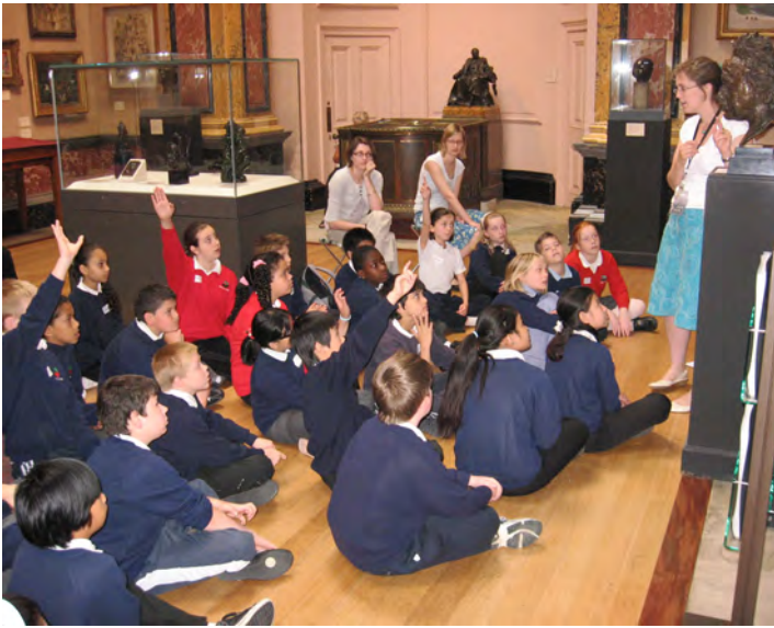
Sharing ideas in the gallery session