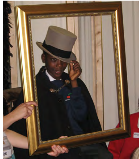
Posing for portraits in the studio

The Moving On Project was designed to support children moving from primary to secondary school and to foster closer links between a local secondary school and its feeder primary schools.