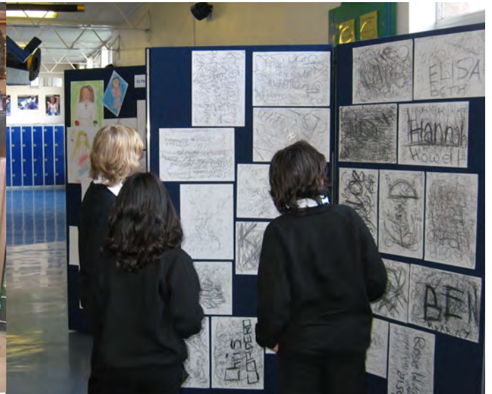
Visitors to exhibition at Netherhall School